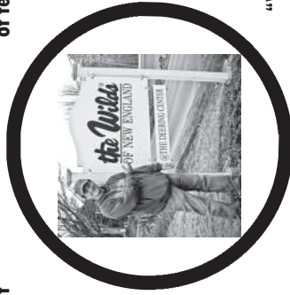
The Wilds Of New England Deering, NH

Our focus for the day will be Article 1 of the confession entitled "Of the Scriptures":